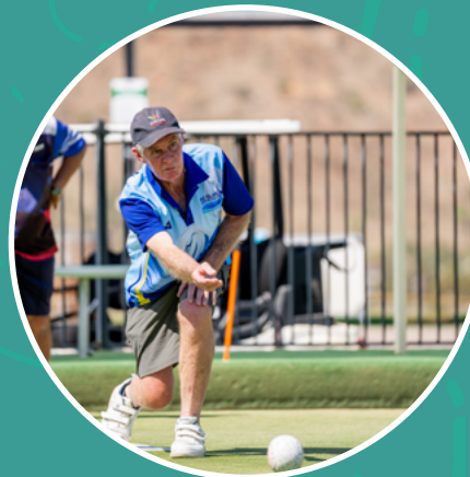
Boosts local economy