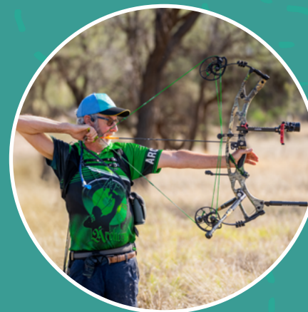
Unmissable social program