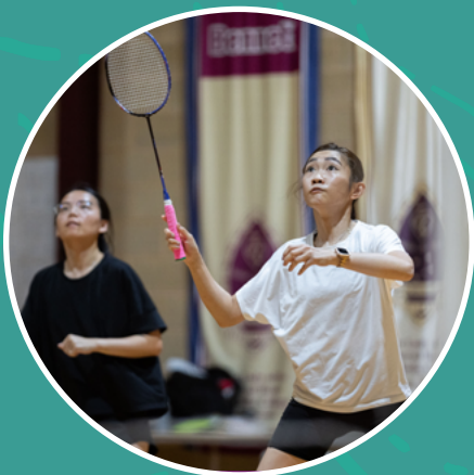
Longest running Masters Games in Australia