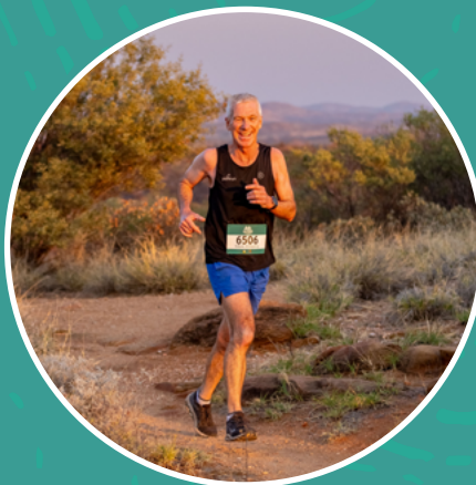
Spectacular Territory destination