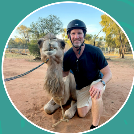
ASMG Ambassador: footy legend, Nathan Buckley